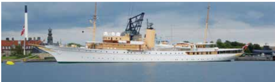
The HDMY Dannebrog