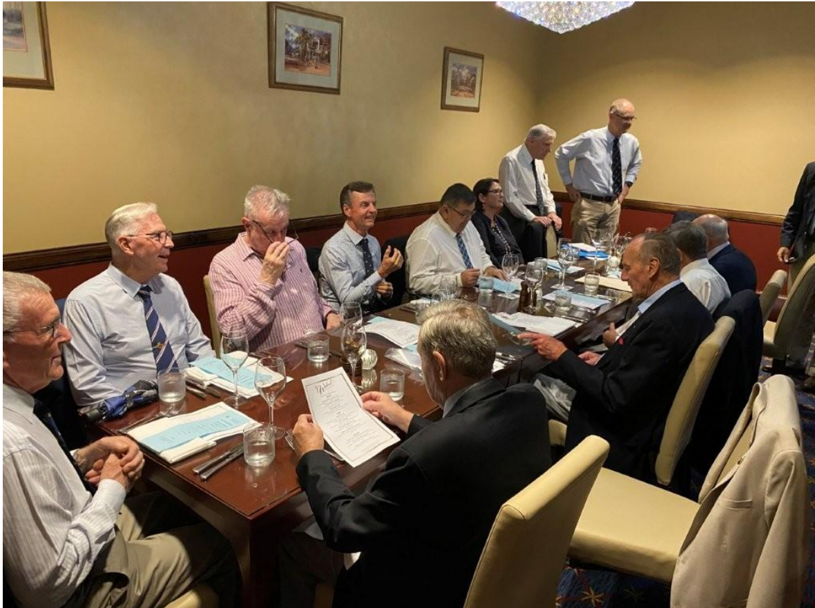
Squeezing in the remaining members for the Starboard team.